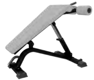
ADJUSTABLE ABDOMINAL DECLINE BENCH 9NN-B7200