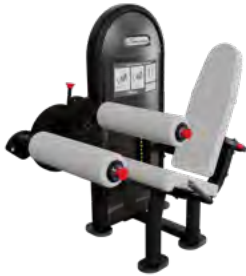
DUAL LEG EXTENSION/ LEG CURL 9NL-D1014