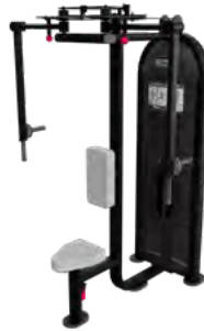
DUAL PECTORAL FLY/REAR DELTOID 9NL-D2110