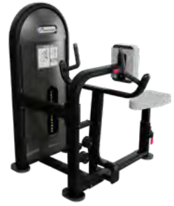
VERTICAL ROW 9NL-S3320