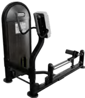
GLUTE PRESS 9NL-S1012