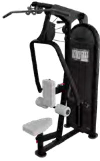
DUAL LAT PULL DOWN/VERTICAL ROW 9NL-D3340