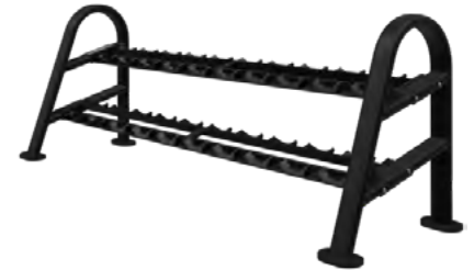
DUMBBELL RACK 10-PAIR/2 TIER 9NN-R8001