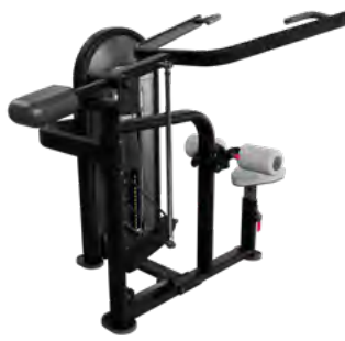
LAT PULL DOWN 9NL-S3310