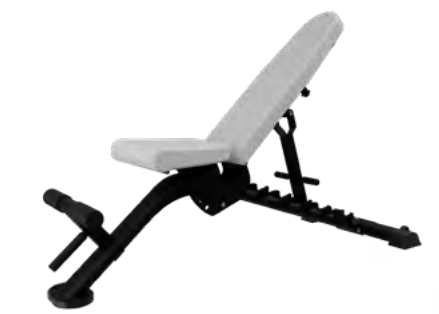
MULTI-ADJUSTABLE BENCH 100* 9NN-B7506-XXXXX