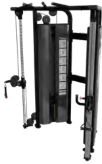
DUAL ADJUSTABLE PULLEY 9NL-D2002