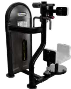
ROTARY TORSO 9NL-S6300