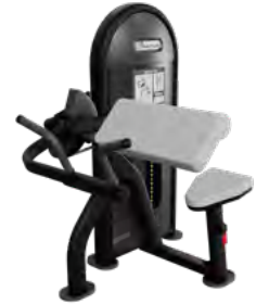
BICEPS CURL 9NL-S5100