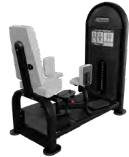
DUAL INNER/ OUTER THIGH 9NL-D1015