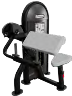
TRICEPS EXTENSION 9NL-S5110