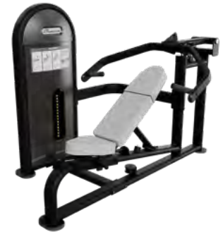
DUAL MULTI-PRESS 9NL-D2120