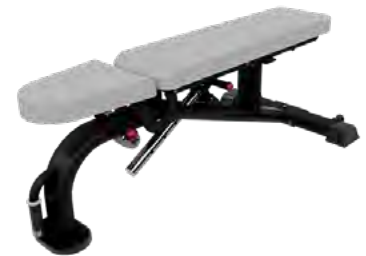
MULTI-ADJUSTABLE BENCH 9NN-B7501