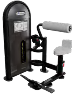
DUAL ABDOMINAL/LOWER BACK 9NL-D6330