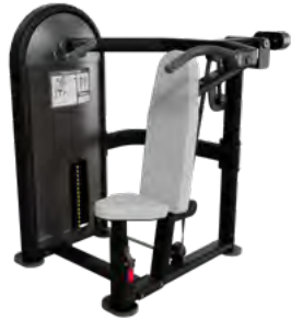
SHOULDER PRESS 9NL-S4100