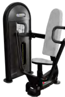
CHEST PRESS 9NL-S2100