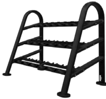
DUMBBELL RACK 10-PAIR/3 TIER 9NN-R8002