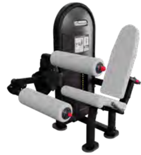
LEG CURL 9NL-S1011