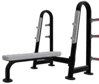
OLYMPIC FLAT BENCH 9NN-B7503