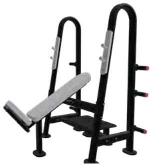
OLYMPIC INCLINE BENCH 9NN-B7201