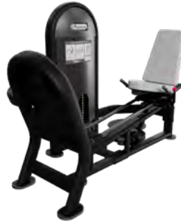
DUAL LEG PRESS/ CALF RAISE 9NL-D1013