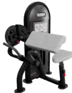
DUAL BICEPS CURL/TRICEPS EXTENSION 9NL-D5120