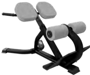
45 DEGREE BACK EXTENSION 9NN-B7502