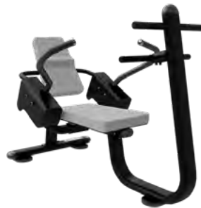
AB BENCH 9NN-B7505