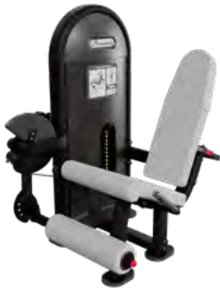
LEG EXTENSION 9NL-S1010