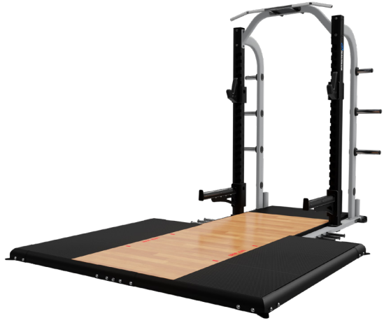
*Platform shown with Half Rack HDHR2